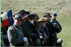
5 TH TX MEMBERS REST AFTER DRILL AT THE APRIL FLEA MARKET.