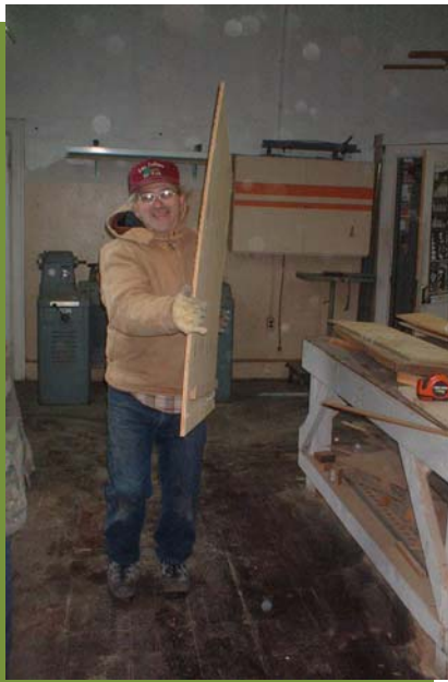
Service with a smile!