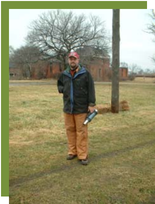
Got coffee, will work!