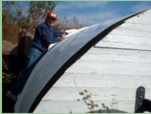
RIC JULIAN INSTALLS A CASEMATE COVER – OCTOBER 30, 2006.