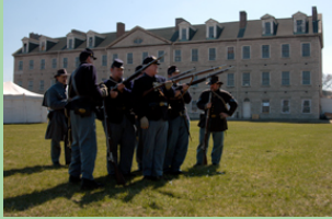
MEMBERS OF THE 17 TH MICHIGAN DRILL IN FRONT OF THE BARRACKS.